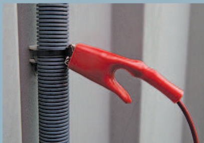
Small diameter cable tracing techniques