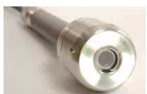
P340 2"/50mm self leveling camera